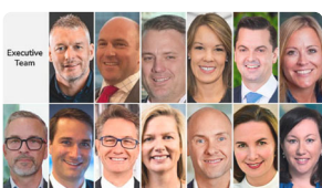
Scyne Advisory unveils its executive team (for now)