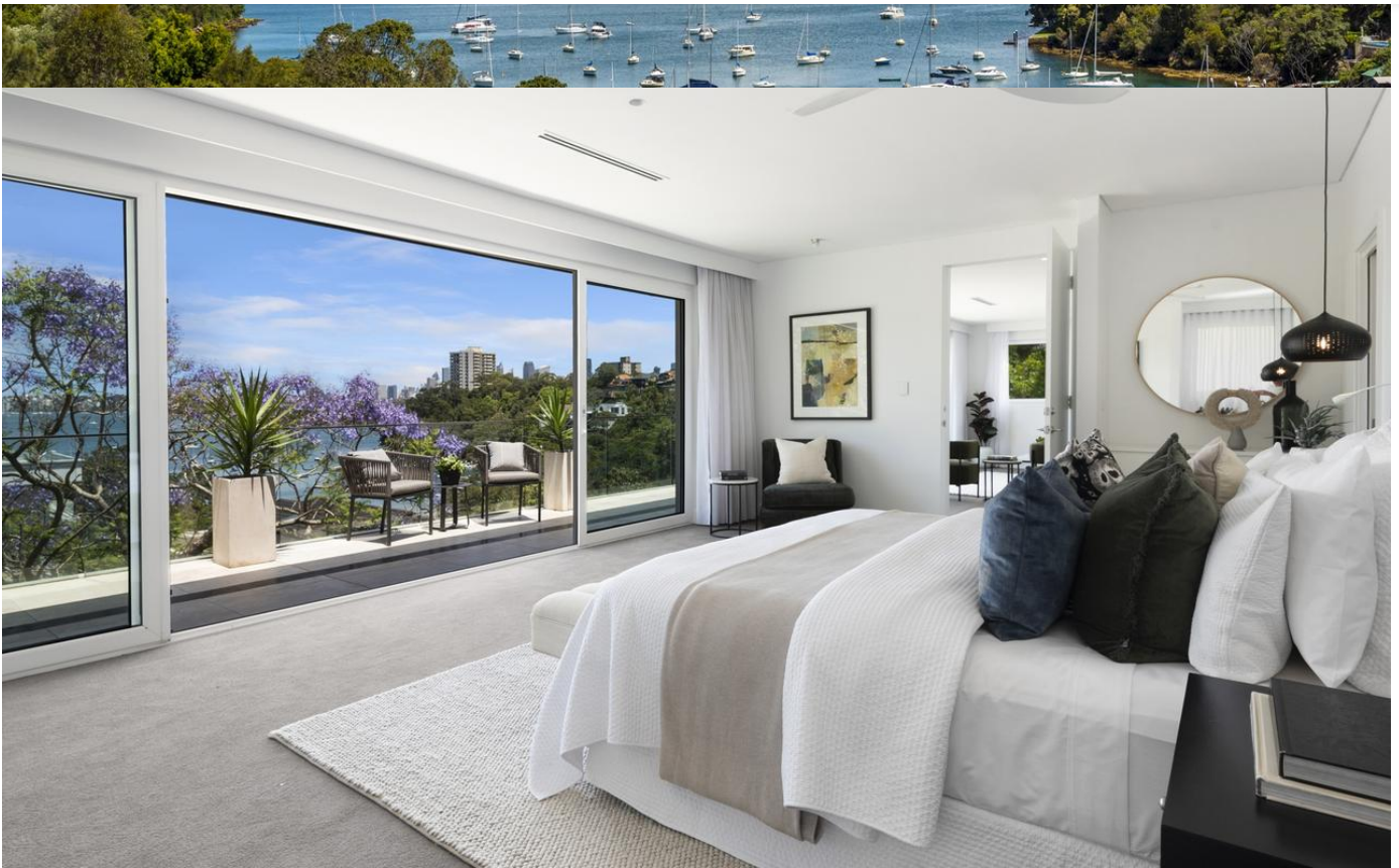
One of the six bedrooms.

MORE: Block twist as Lambo guy makes shock buy